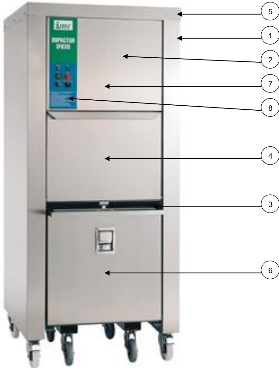
Parts Illustration – IP600 Fig. 4