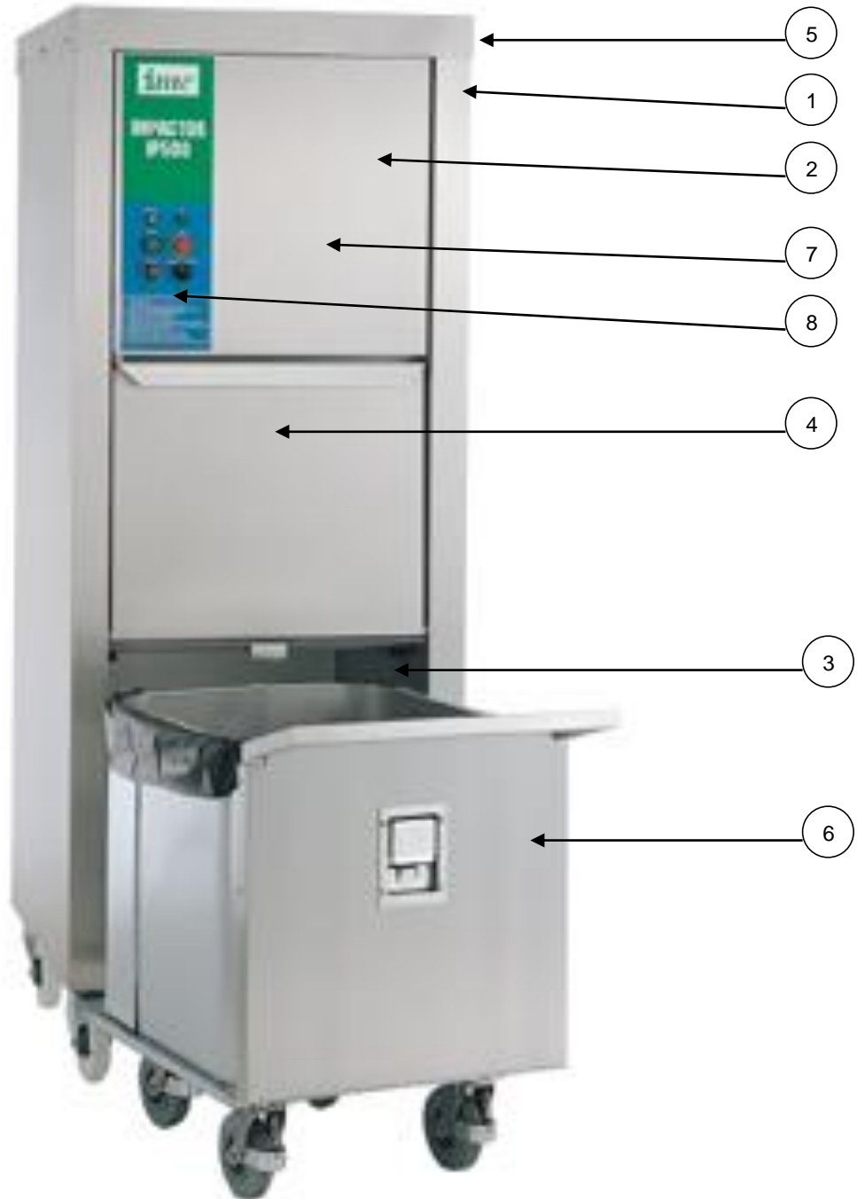
Parts Illustration – IP500 Fig.3