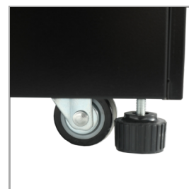
Castors and locking feet